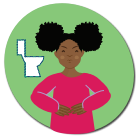
Vomiting / diarrhea